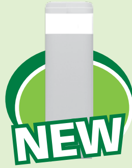
1L or less Milk or Milk Substitute Carton