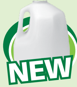
2L or 4L Milk Jug