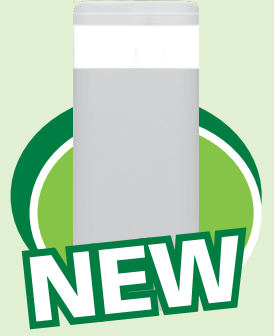
2L Milk or Milk Substitute Carton