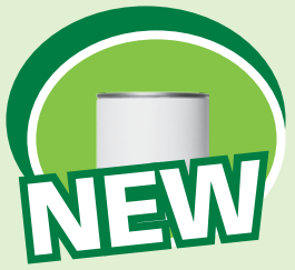
Condensed or Evaporated Milk Can