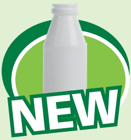
Yogurt Drink Bottle